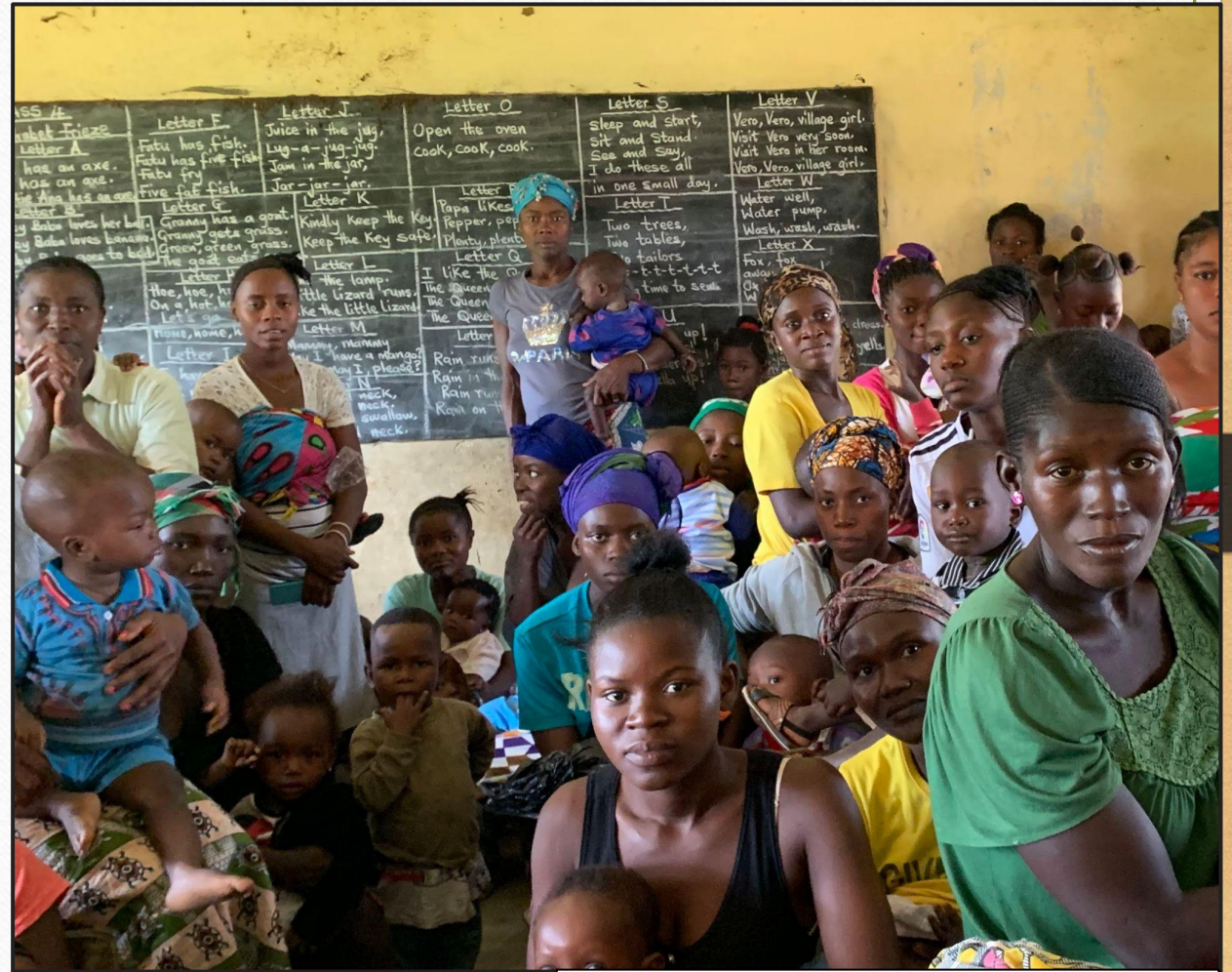
Mothers and children awaiting care at Mobile Outreach Clinic