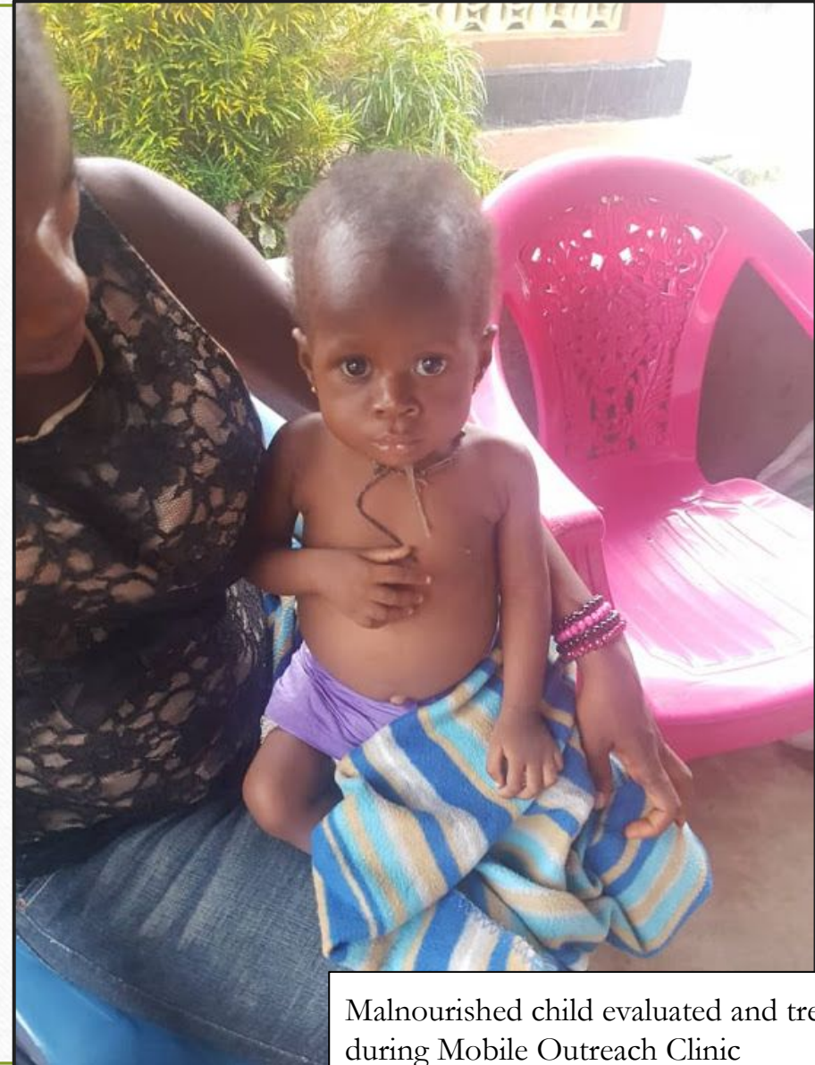
Malnourished child evaluated and treated during Mobile Outreach Clinic