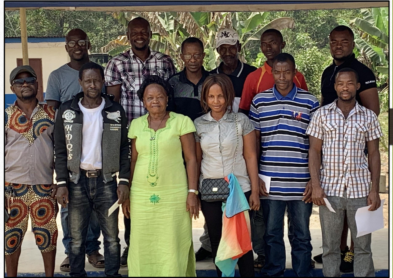
RHCI Full time staff