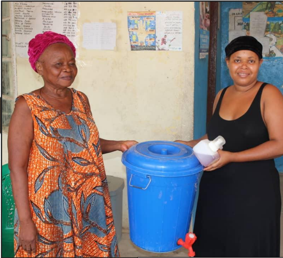
Hand washing buckets donated to Community Health Centers