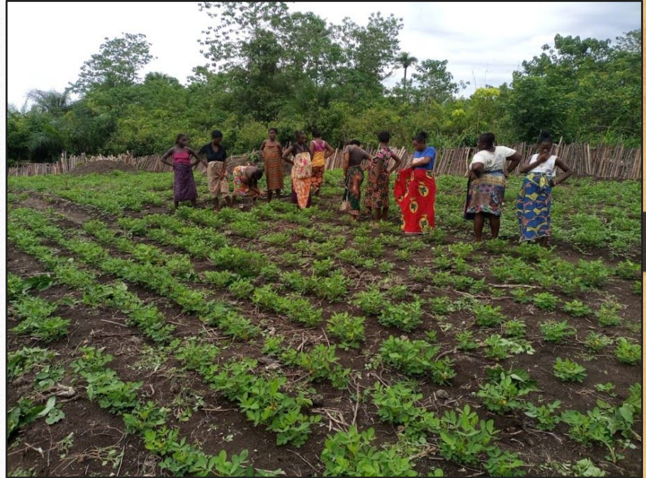
Women from the Birth Waiting Home assisting and learning on RHCI's farm