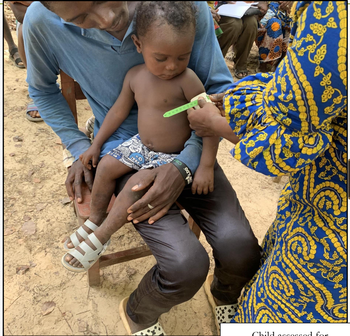
Child assessed for malnutrition with MUAC