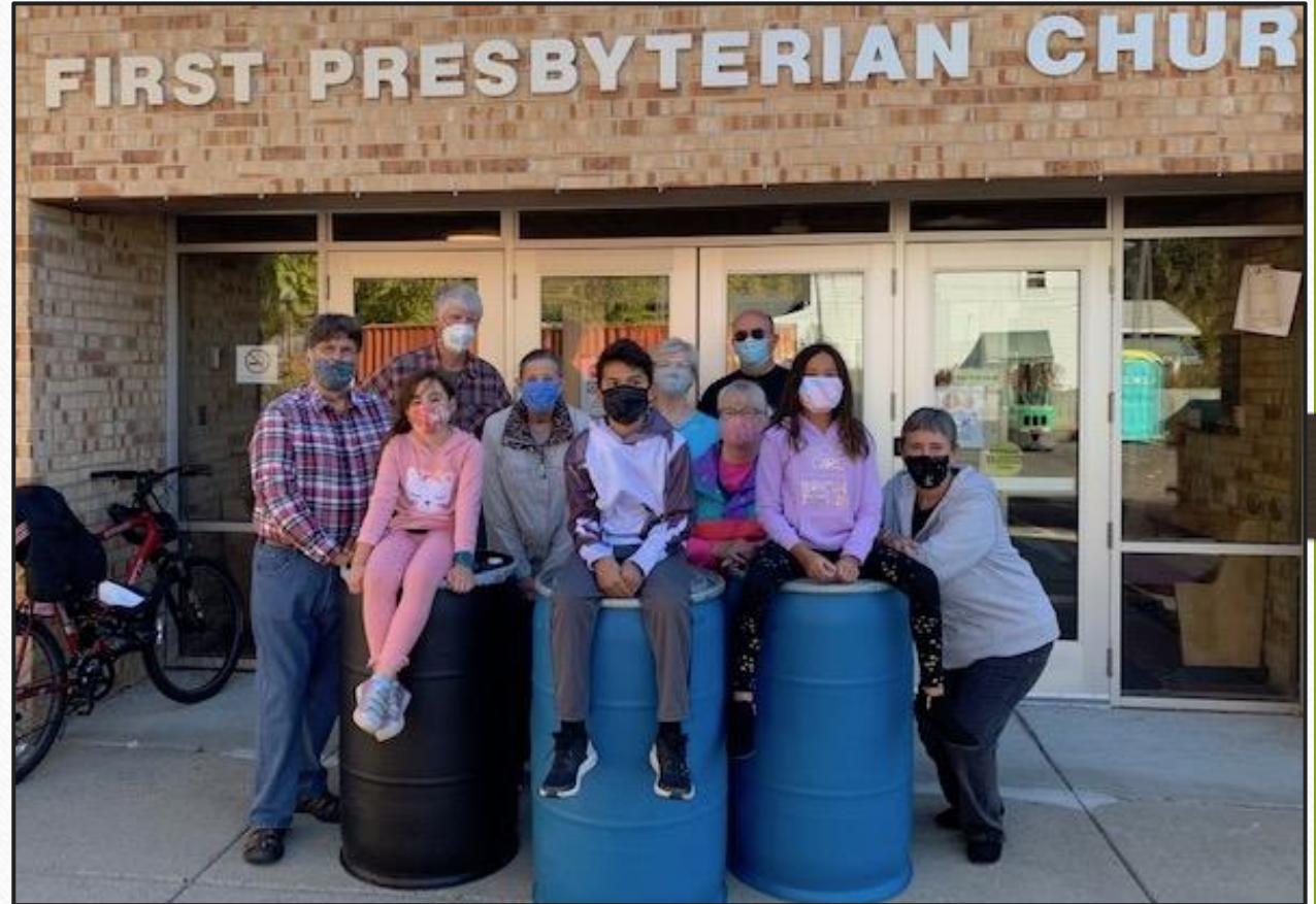
Volunteers from First Presbyterian Church of White Bear Lake assist in packing barrels with supplies