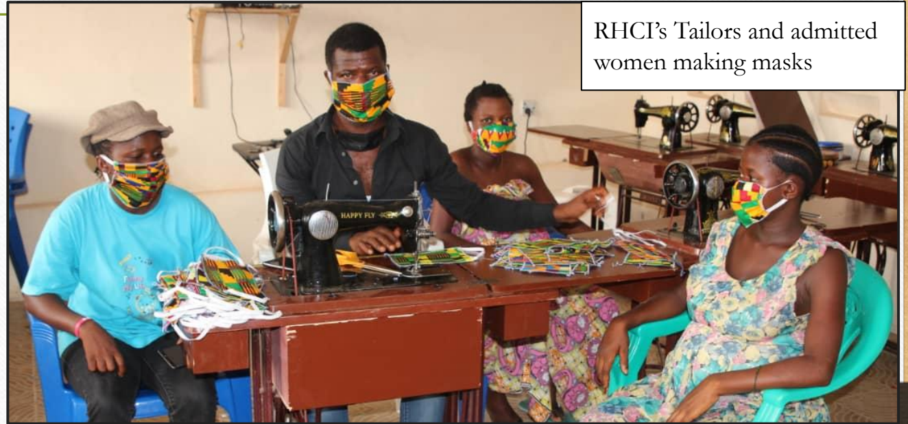
RHCI's Tailors and admitted women making masks