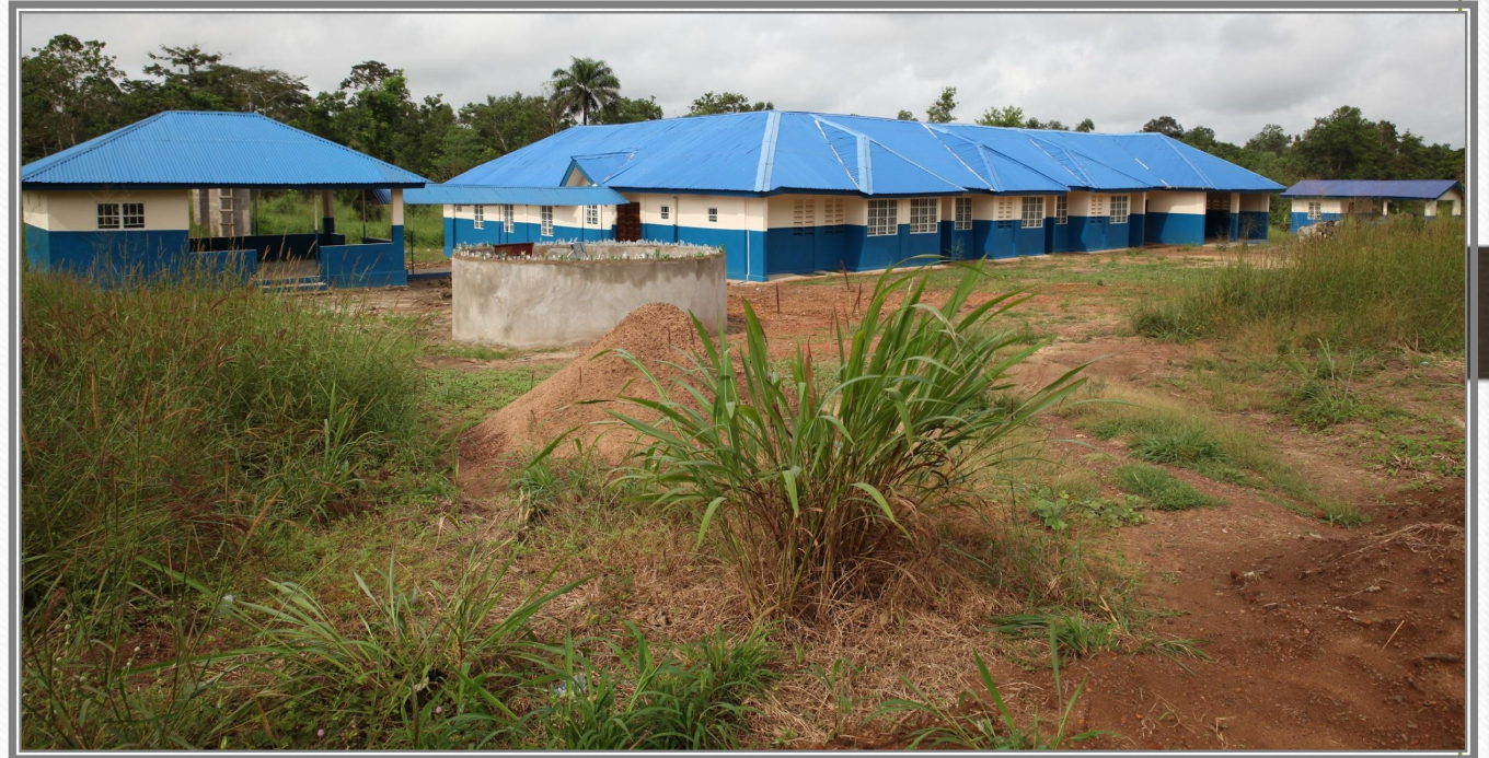
Mbao-mi Birth Waiting Home