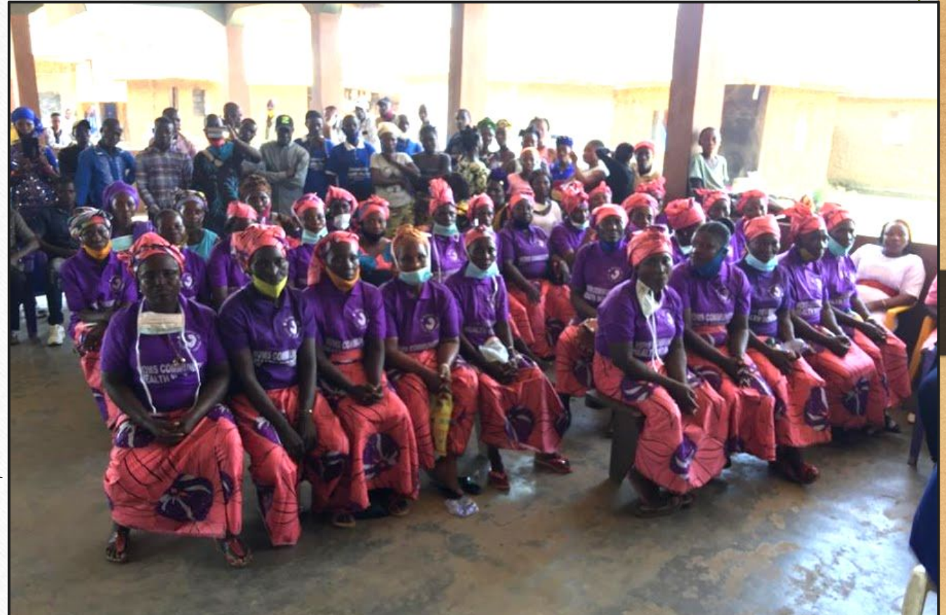
Community Health Workers receiving their certificates

a collaboration of RHCI and Midwives on Missions of Service