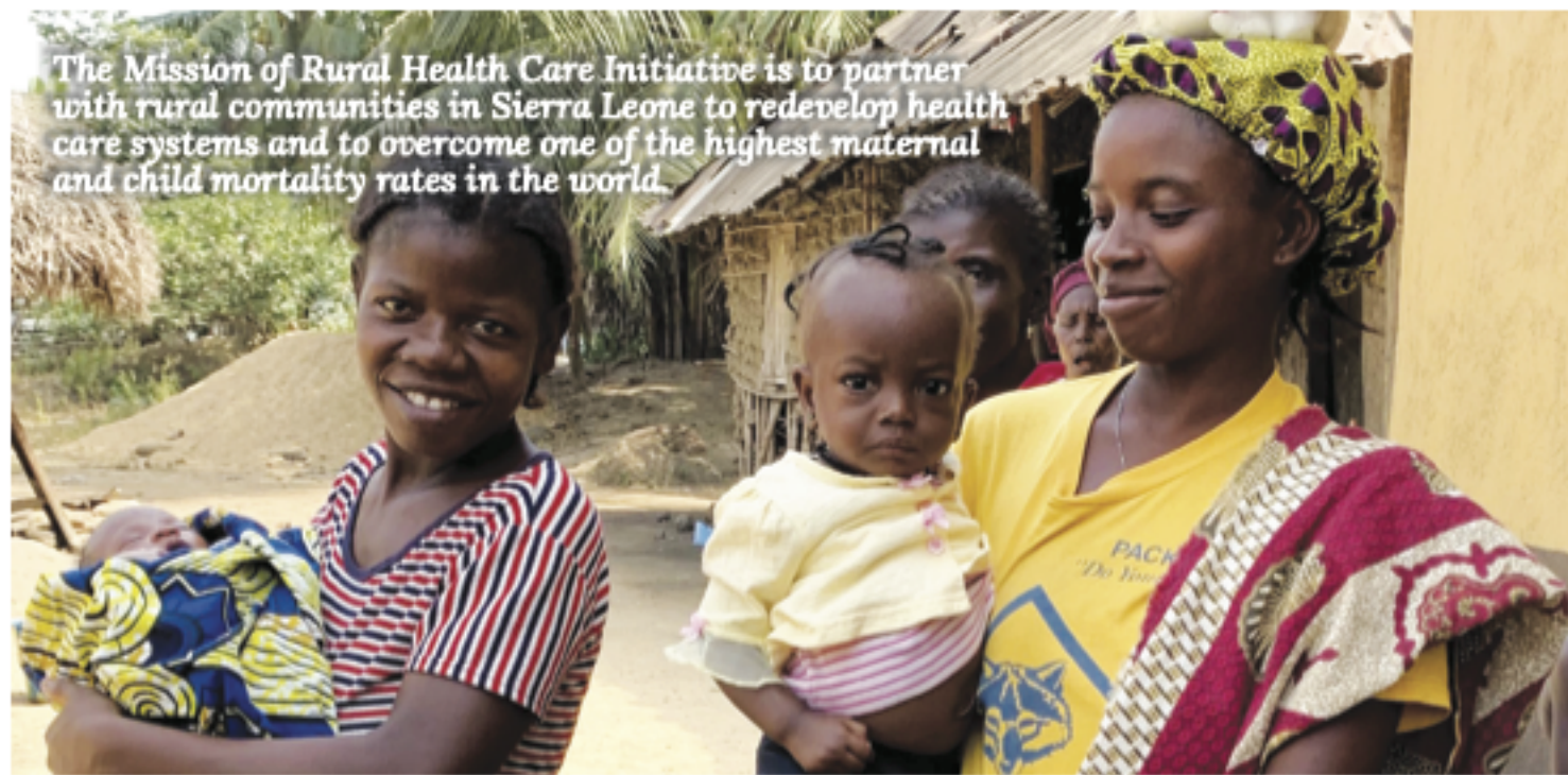
Grateful new mothers and former beneficiaries of the Birth Waiting Home now receive health care with their newborns at our mobile outreach clinics. Photographed during a home visit in the village of Julian, 2020.

The Mission of Rural Health Care Initiative is to partner with rural communities in Sierra Leone to redevelop health care systems and to overcome one of the highest maternal and child mortality rates in the world.